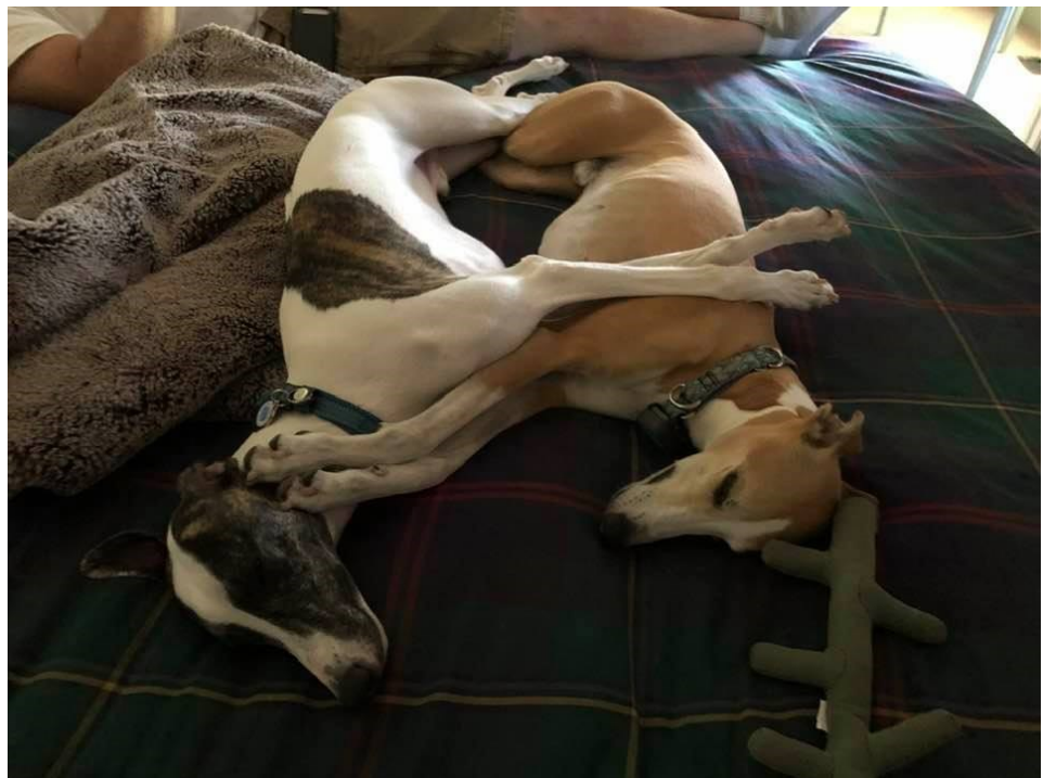
Sweet boys PiP & Zenith Moore