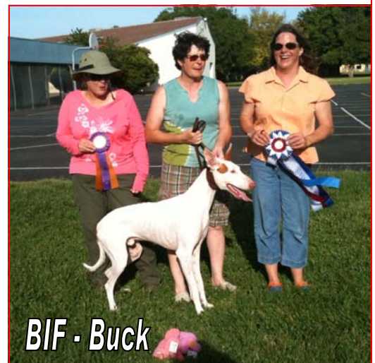
BIF - Buck