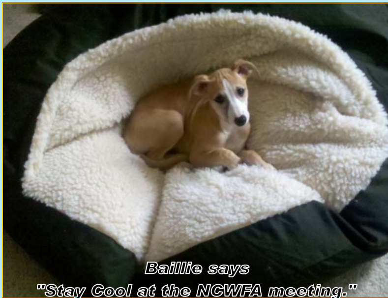
Baillie says "Stay Cool at the NCWFA meeting."

The next NCWFA meeting will Be held on SAT, SEPT. 17th, in VALLEJO at the SF/PKC show (time TBA).