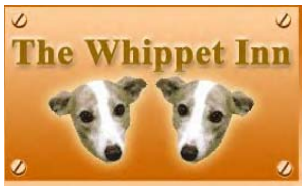
I don't know where the "Whippet Inn" is, but I bet they take dogs and I want to stay there! - editor.