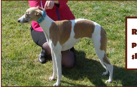
Rescue Cali playing show dog